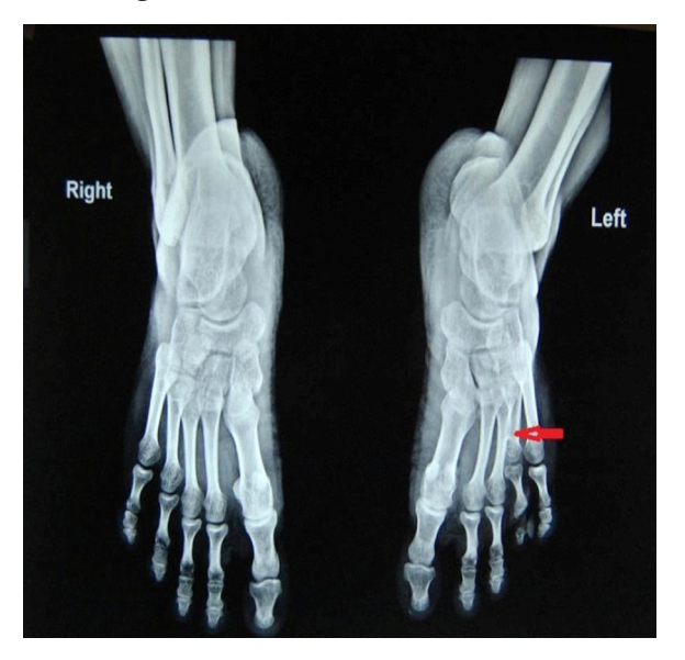
Fig 2b: Show shortened 4th metatarsal. On right side no variation evident

From fig 2a and fig 2b it is evident that the 4th toe appears shortened on left side because