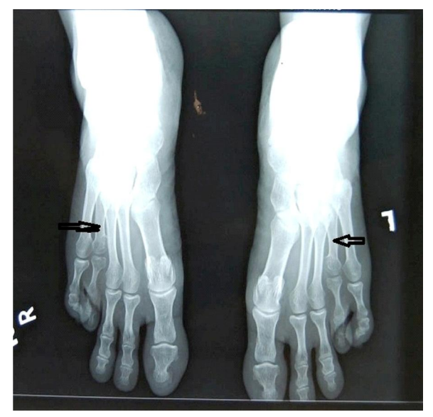
Fig 2a: Show left foot with 4th toe brachydactyly right foot normal