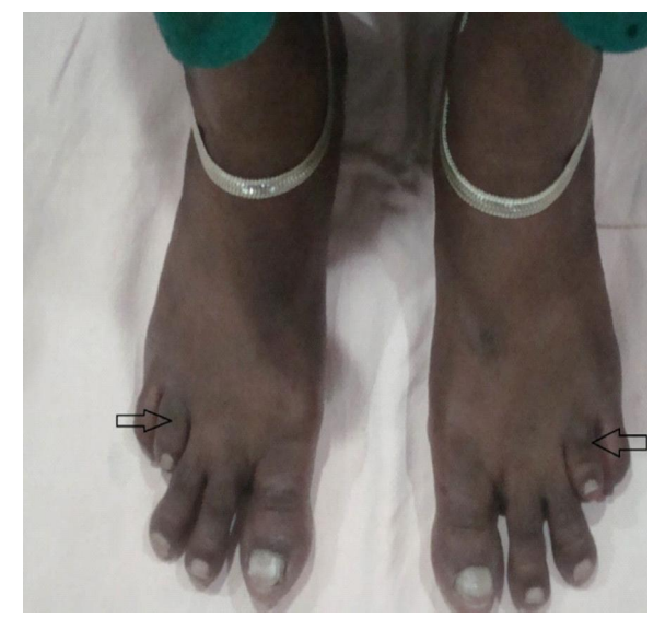
Fig 1a: Show bilateral 4th toe brachydactyly

examination it was found that the 4th toes were shortened bilaterally. No evidence of any lesions of nails. Both right and left hands were absolutely normal. Her height was 5ý2ýý. Rest general and systemic examinations were normal.